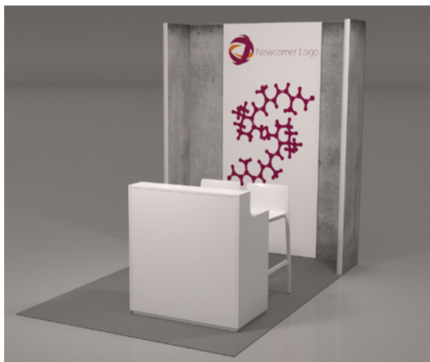
Example of standard equipment