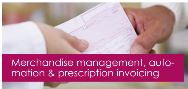
Merchandise management, automation & prescription invoicing

From pharmaceutical companies, distributors and wholesalers to importers and exporters as well as software and service providers for the healthcare market, all key players of the pharmacy industry will showcase their companies and their most important product lines at expopharm 2023.