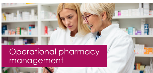
Operational pharmacy management